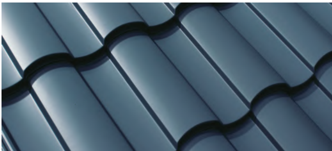
New Denim Blue